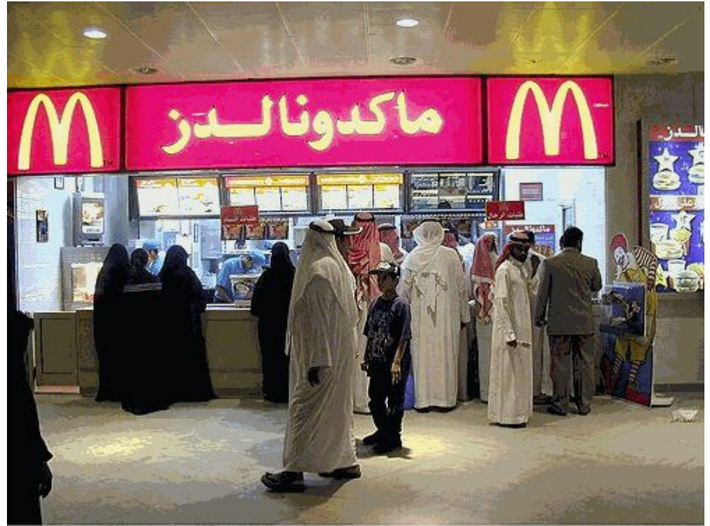
P5150554, Segregation at McDonalds. Women queue on the left section. Men on the right. May 2000. Riyadh, Saudi Arabia.